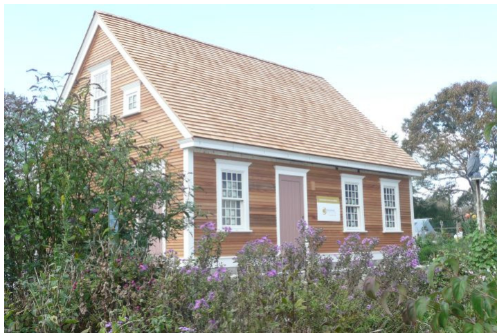
CHS Museum October 2011

Construction of Charlestown's New Museum began in June and will continue throughout the fall and winter as funds allow. We are very excited that our museum building fund thermometer now shows that we have raised $100,000! We have been overwhelmed by the support our community has shown - financial donations, volunteer labor, free or deeply discounted materials. It is only through this support that we have been able to make so much progress. Thank you.