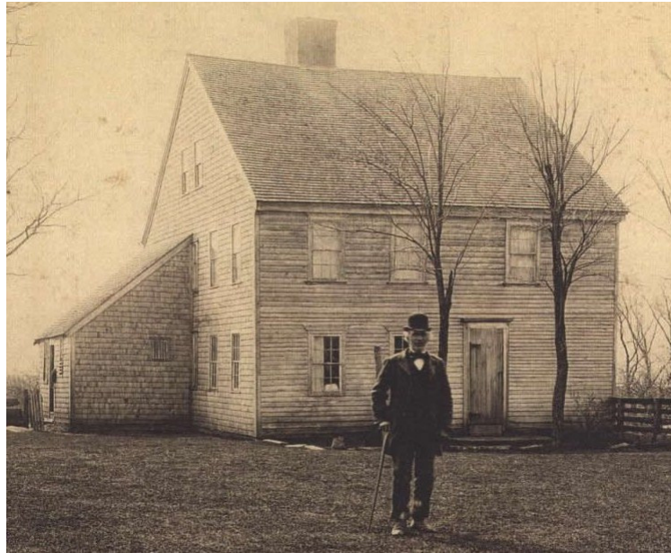
King Tom Farm